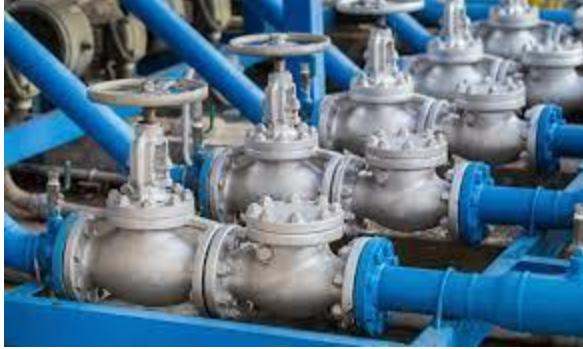
Pump & valve