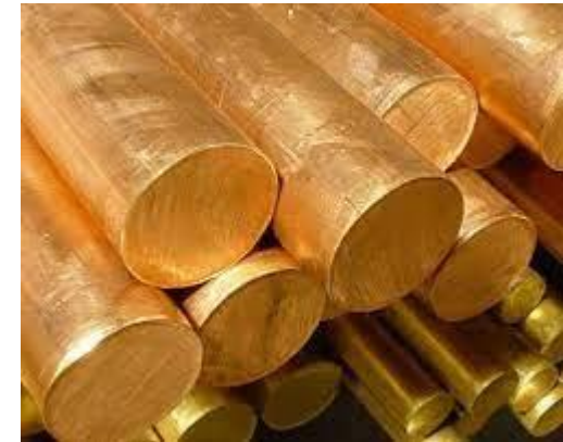
Brass and Gun metal