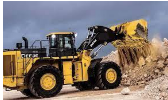
Earthmoving & heavy Engineering