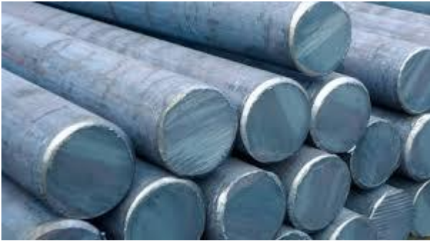
Carbon steel and alloy steel