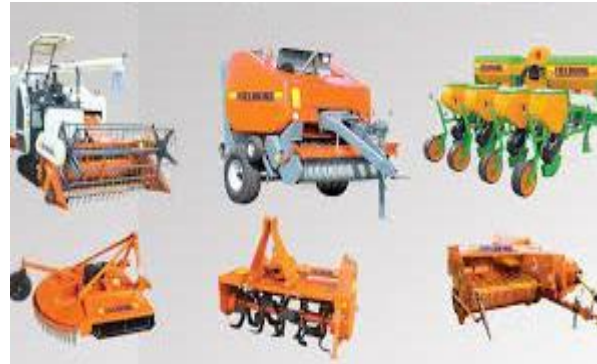
Agriculture & Farm equipment